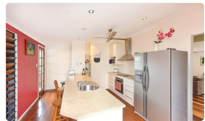
Ejemplo de apartamento