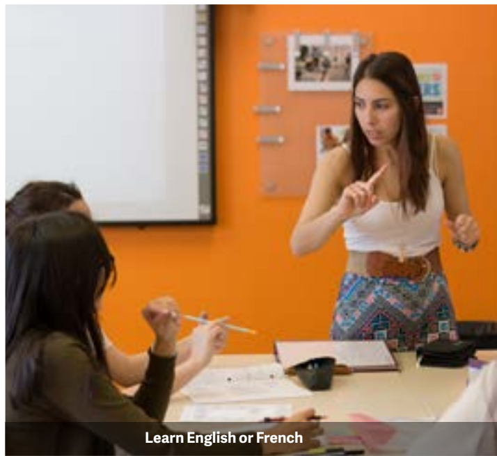
Learn English or French

The activities above are a sample and subject to change.