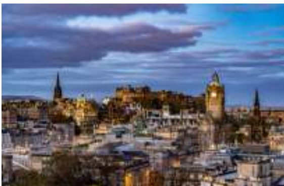
View of Edimburgh