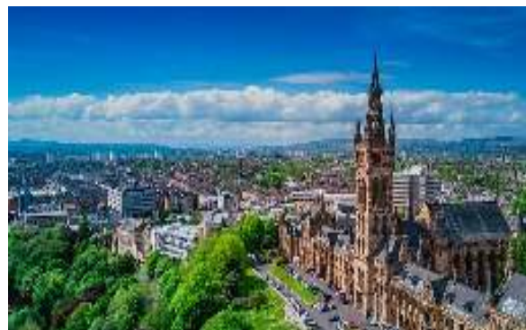
View of Glasgow