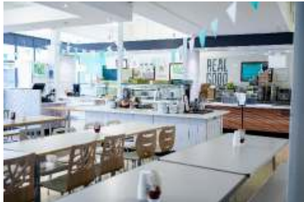
London Docklands University Summer Centre