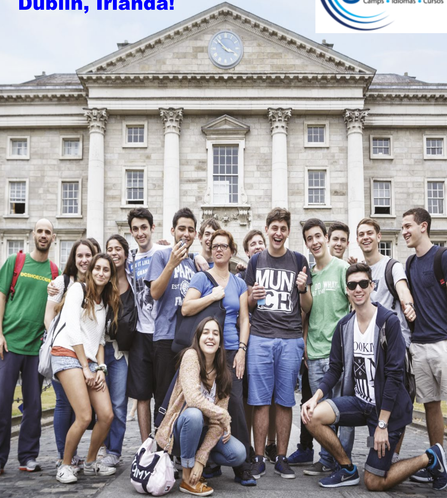
Trinity College, Dublin